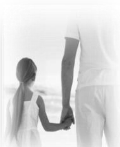
DADDY'S LITTLE GIRL

Please sign up at connection table after service!